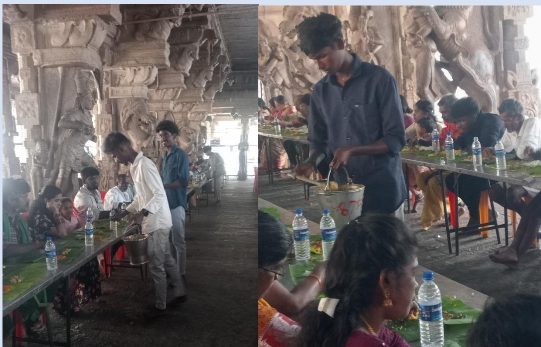
CAMPUS CLEANING WORK